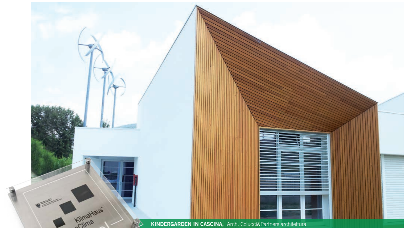
KINDERGARDEN IN CASCINA, Arch. Colucci&Partners architettura

CasaClima School rewards those newly built or restored school buildings and kindergardens, which comply with the idea of sustainability in which ecological as well as sociological and economical aspects are considered.