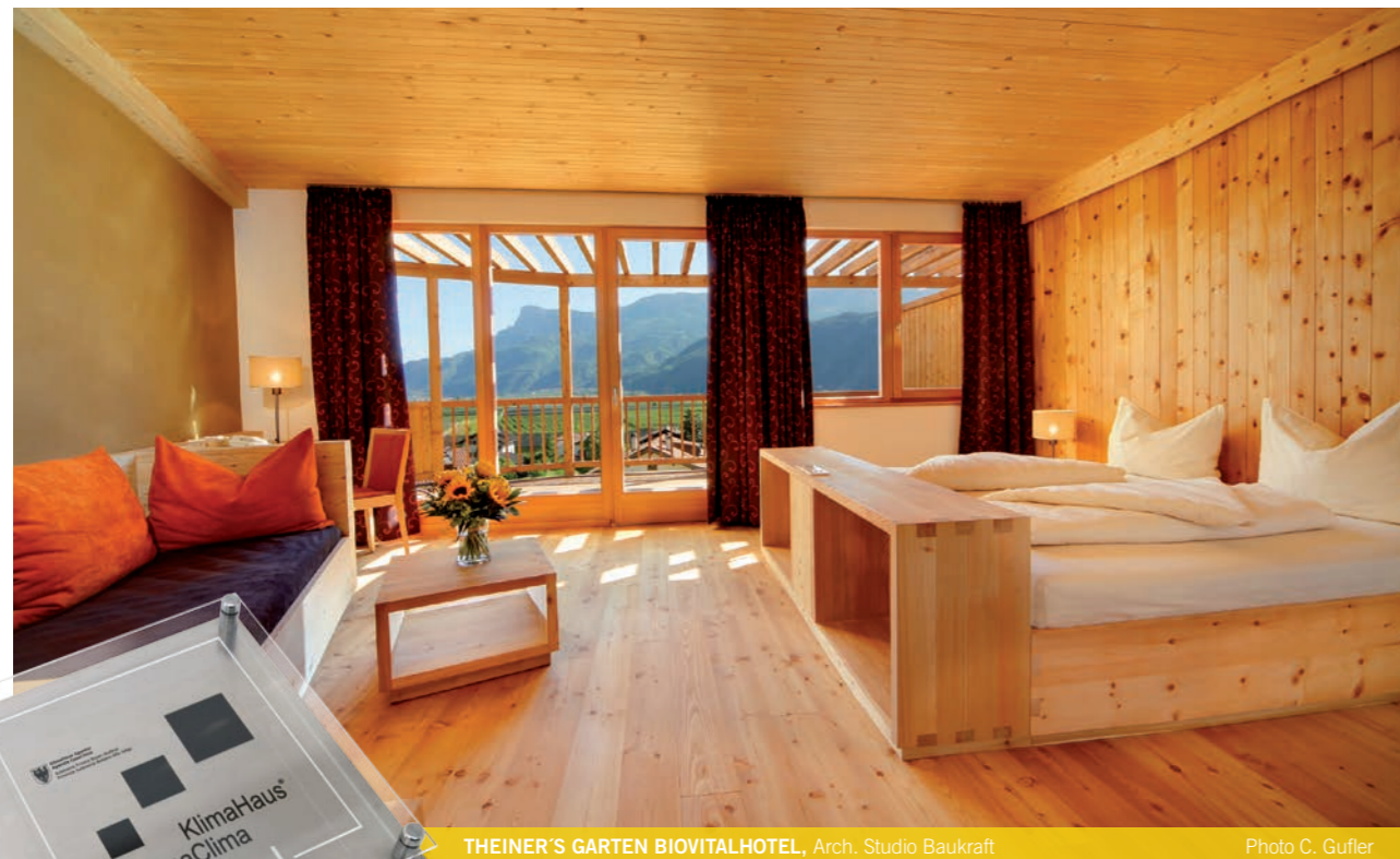
THEINER'S GARTEN BIOVITALHOTEL, Arch. Studio Baukraft